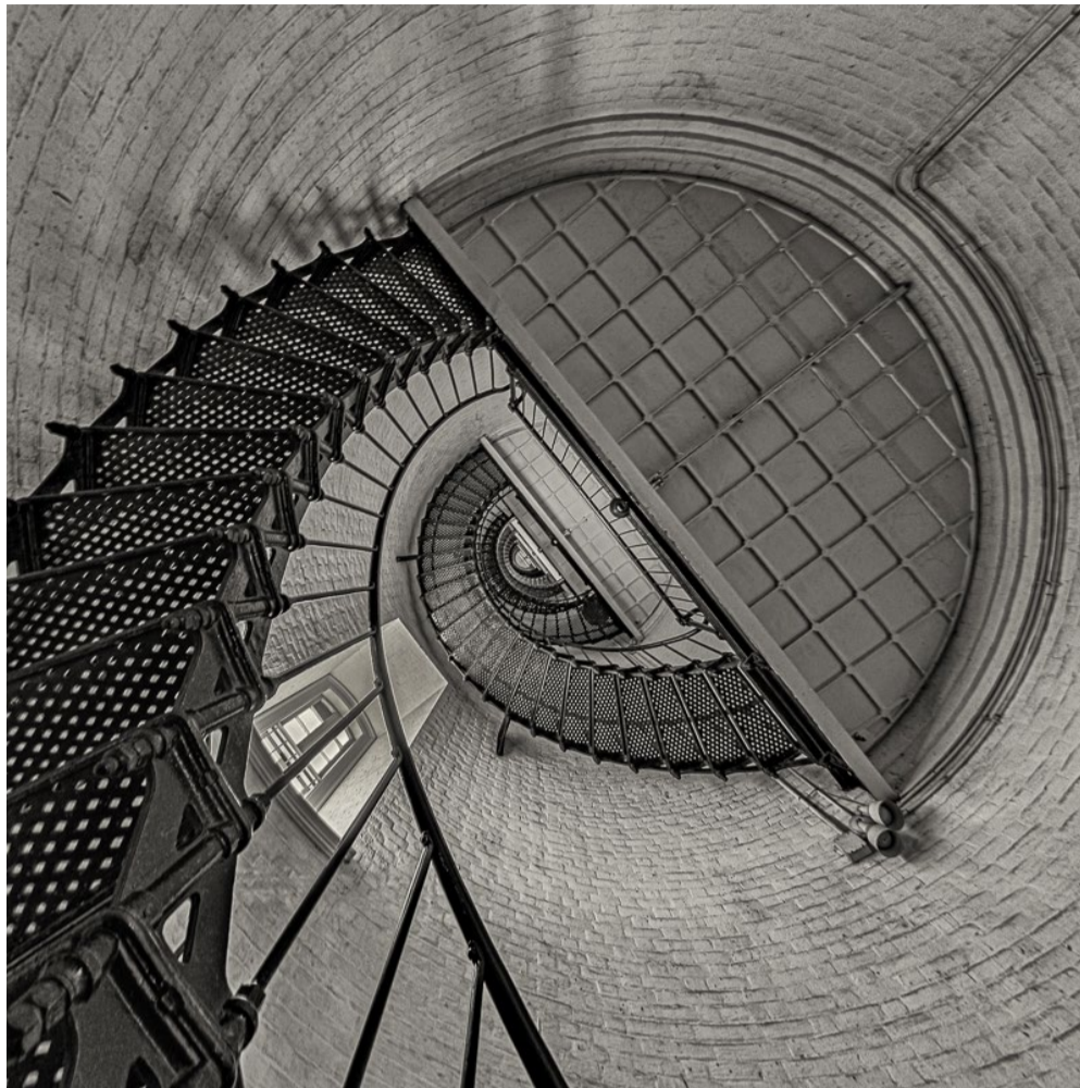
St Augustine Lighthouse Stairway