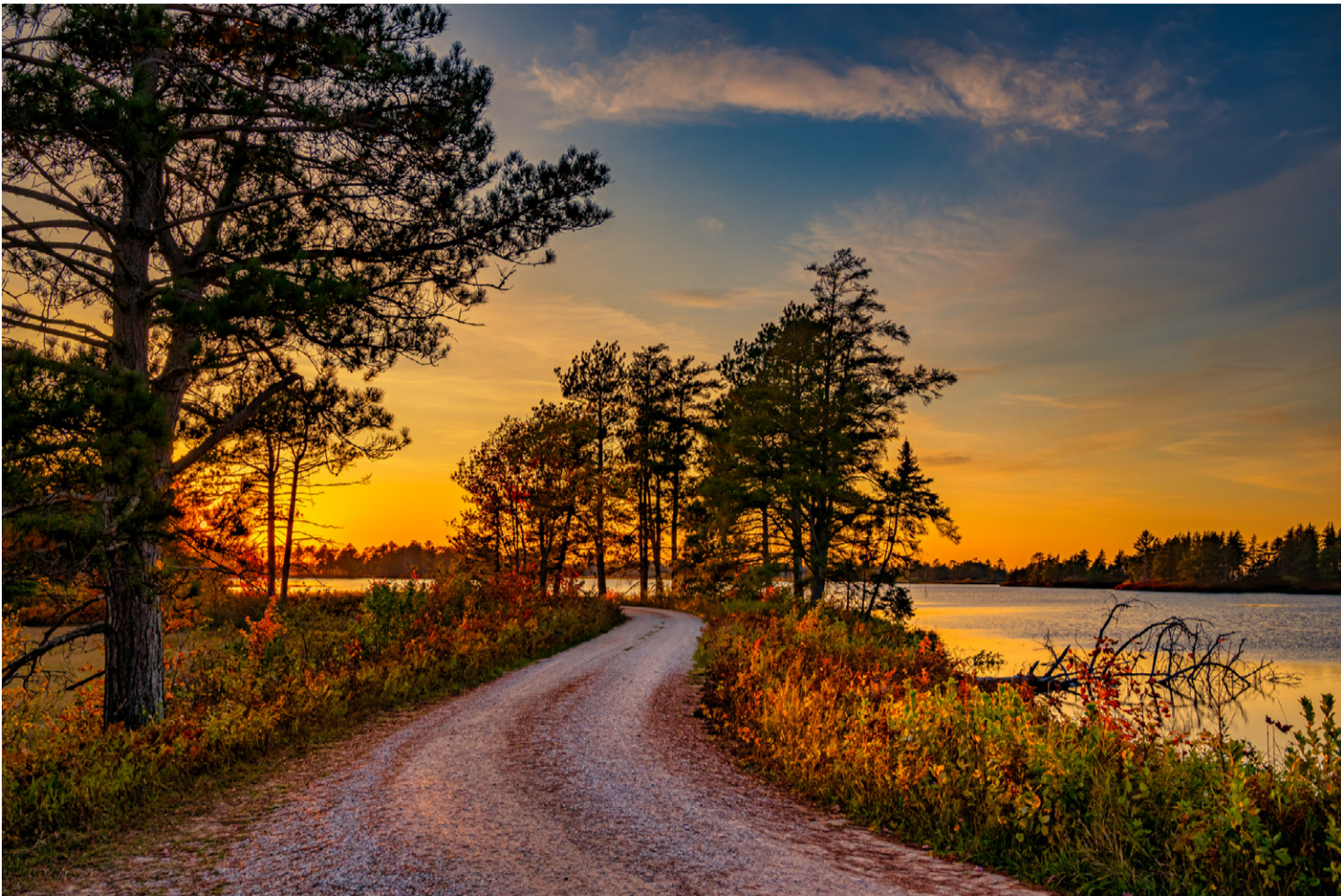
Sunset in Seney NWP