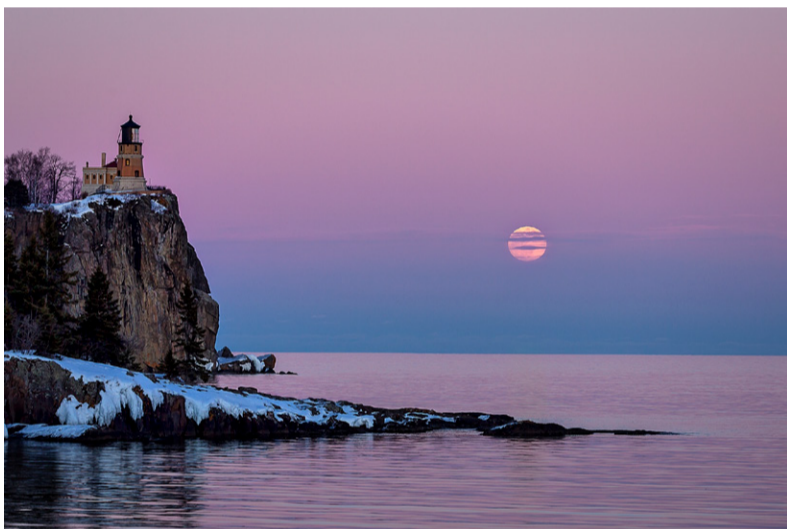
Split Rock Moon Bonnie Zuidema - Fox Valley Camera Club Color Open Projected