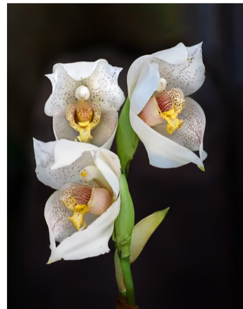
An Orchid 2 Jerry Clish - Fox Valley Camera Club Open Large Print