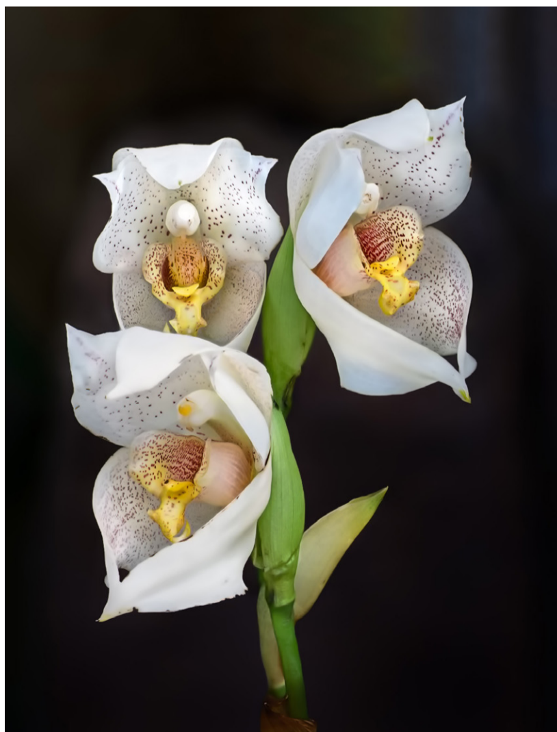
Best of Print Division An Orchid 2 Jerry Clish - Fox Valley Camera Club

Read more at: https://www.brainyquote.com/quotes/steve_jobs_416859