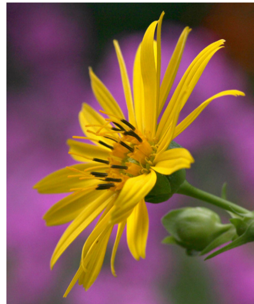
Blooming Beauty 2016 Jim Edlhuber - Retzer Nature Center C.C. Color Open Small Print