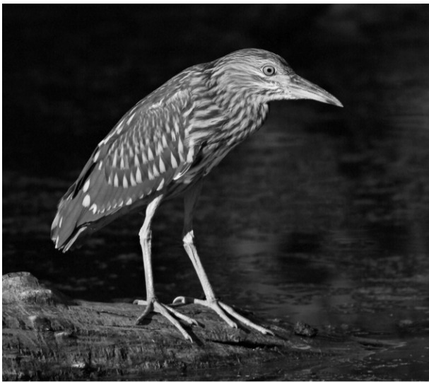
Black Crowned Night Heron Jim Edlhuber - Retzer Nature Center C.C. Mono Open Small Print