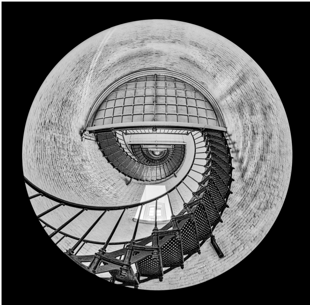
St. Augustine Lighthouse Stairs