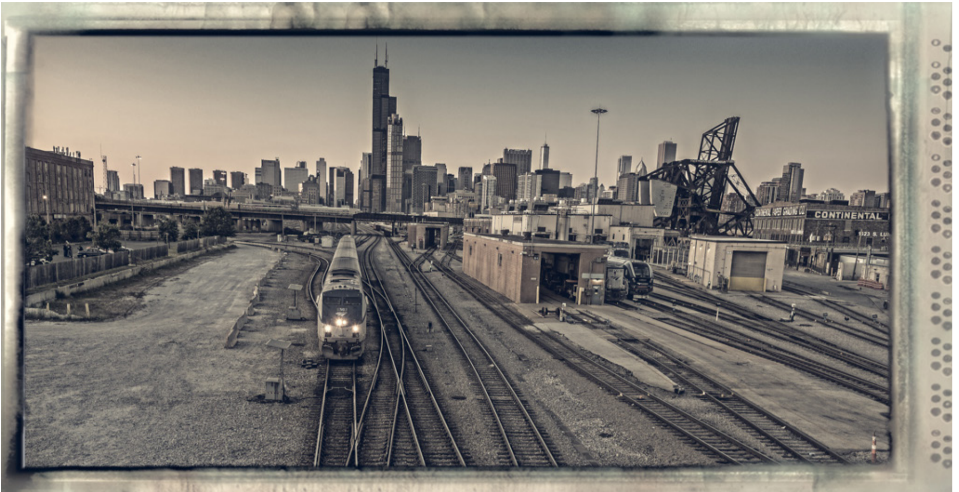
Chicago Skyline by Jeffrey Klug, HonWACCO