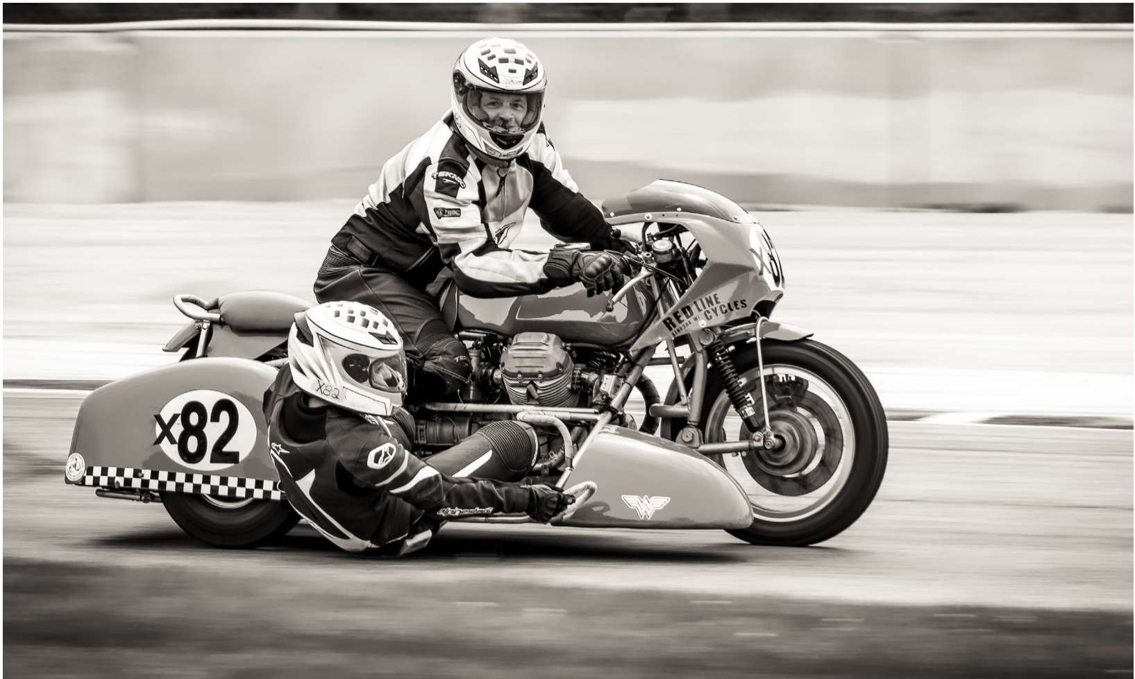
Side Car 82 by Jeffrey Klug