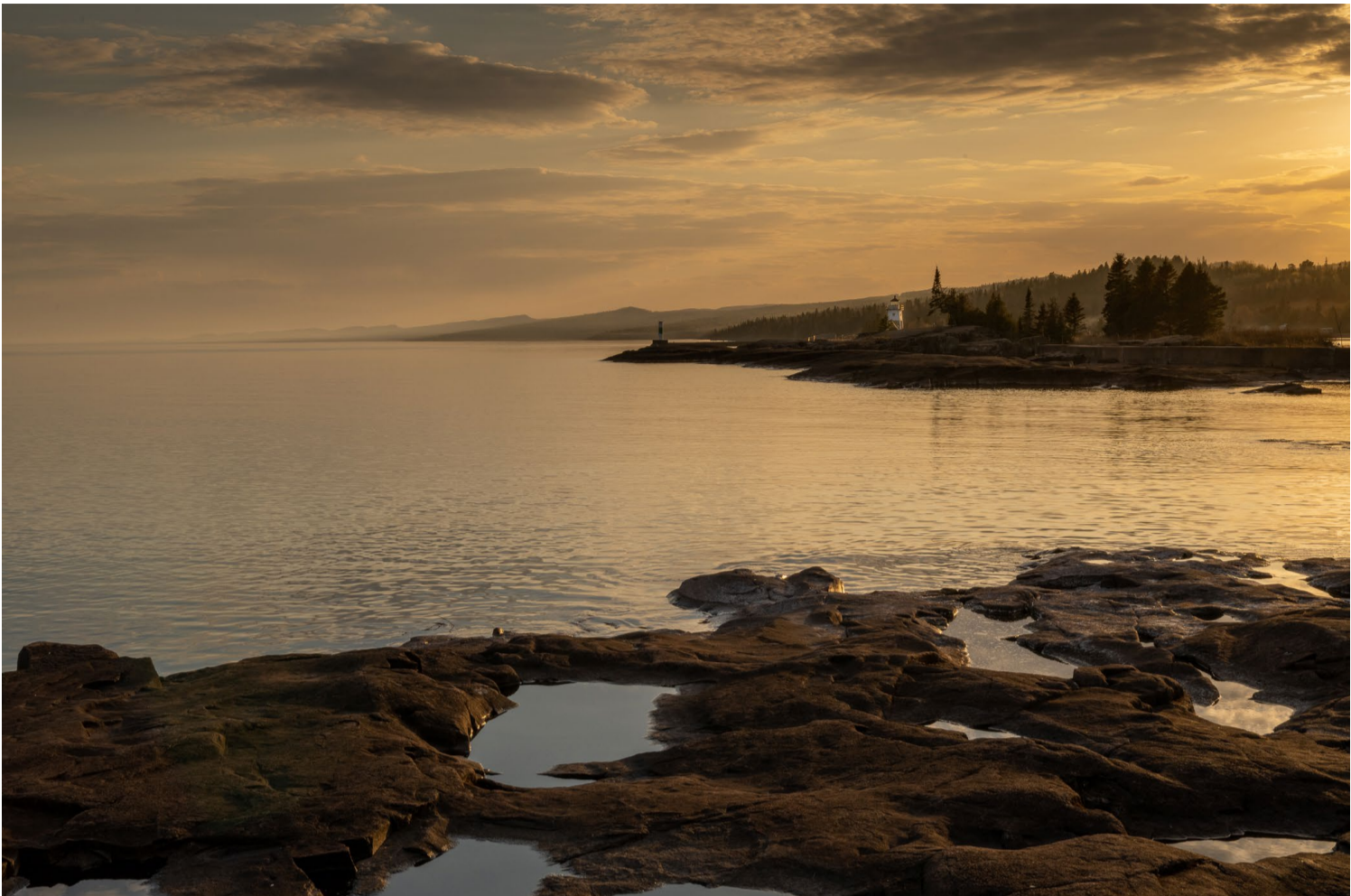
Grand Marais Lighthouse at Sunset